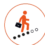
WORK AND CAREER

Listed below is the help and support available within your organisation and in the community.